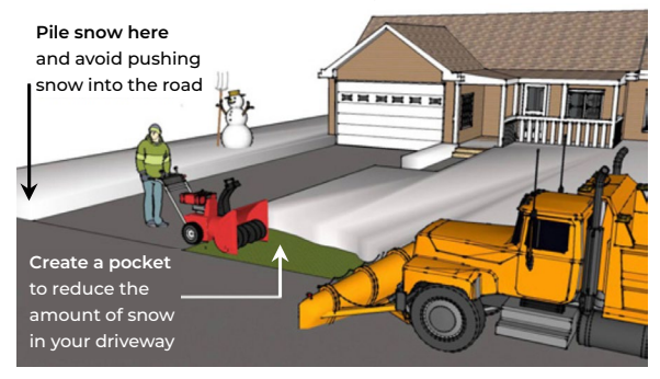
Using this method to clear snow will reduce the amount of snow that accumulates at the end of your driveway!

Before your street has been plowed, we recommend the following: