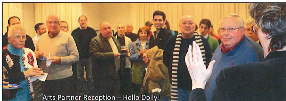
Arts Partner Reception – Hello Dolly!

Here are three great quotes from our post-show Hello Dolly! Starring Sally Struthers survey. 1) "I would love to see more "Broadway" performances. This was amazing. Live shows like this are so grueling. I don't know how they all keep up their intense energy level. Sally has quite a voice and hasn't lost her comedic timing. Fabulous show." 2) "We enjoyed it immensely. It is nice to see a well known actor\actress come to town. Please keep trying to get shows like this." 3) "Enjoyed the Arts Partners reception following the event. Thanks for arranging that."