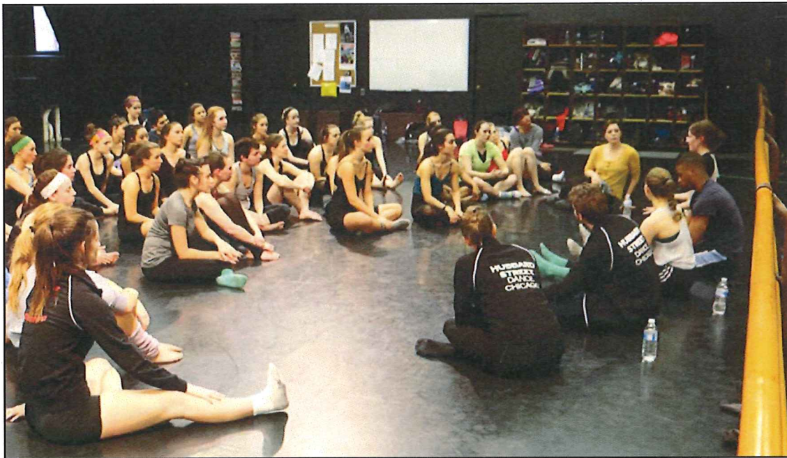
Hubbard Street 2 - Masterclass Illinois State University School of Dance Studio