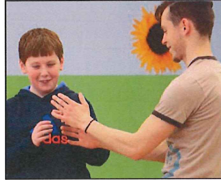
Hubbard Street 2 - Masterclass at Thomas Metcalf Laboratory School