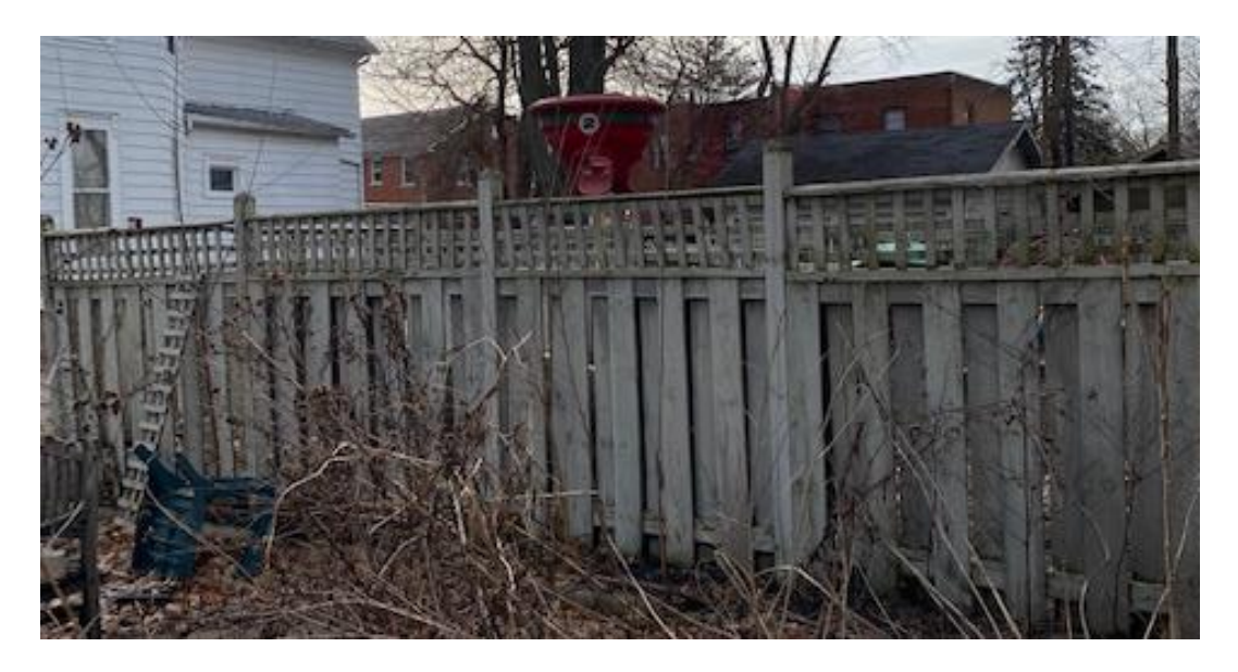
Attachment 2: Profile and material for fence replacement (currently proposed)