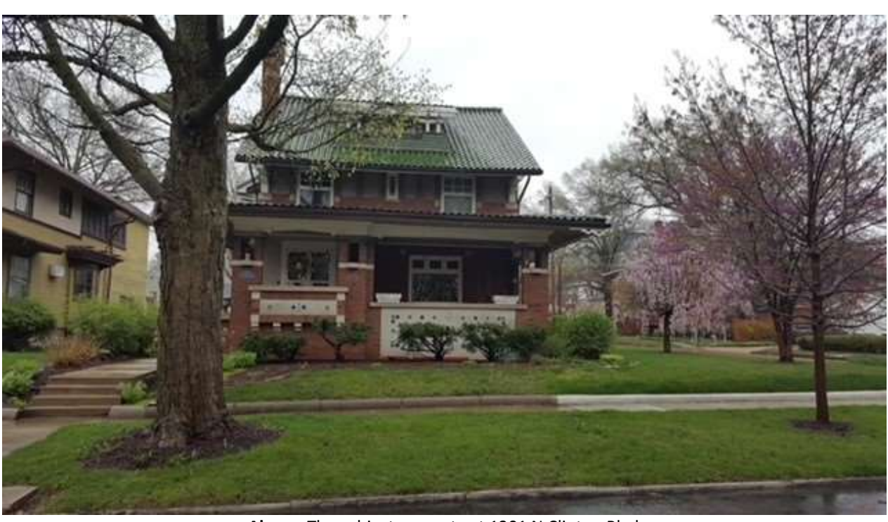
Above: The subject property at 1301 N Clinton Blvd

of Appropriateness for gutter and fascia replacement to the garage for the property located at 1301 N. Clinton Blvd. PIN:14-33-479-019. White Place Historic District.