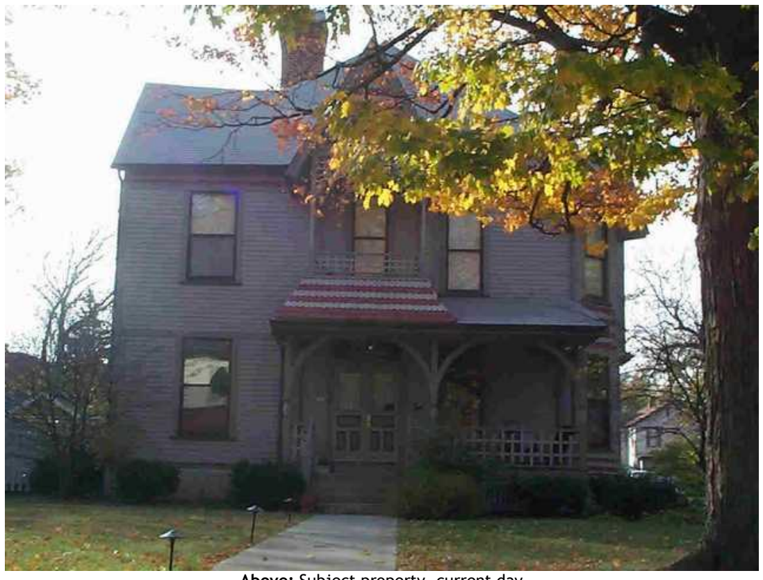
Above: Subject property, current day

for a Certificate of Appropriateness for fence replacement for the property located at 1101 E. Jefferson Street. PIN: 21-03-328-001. Davis-Jefferson Historic District.