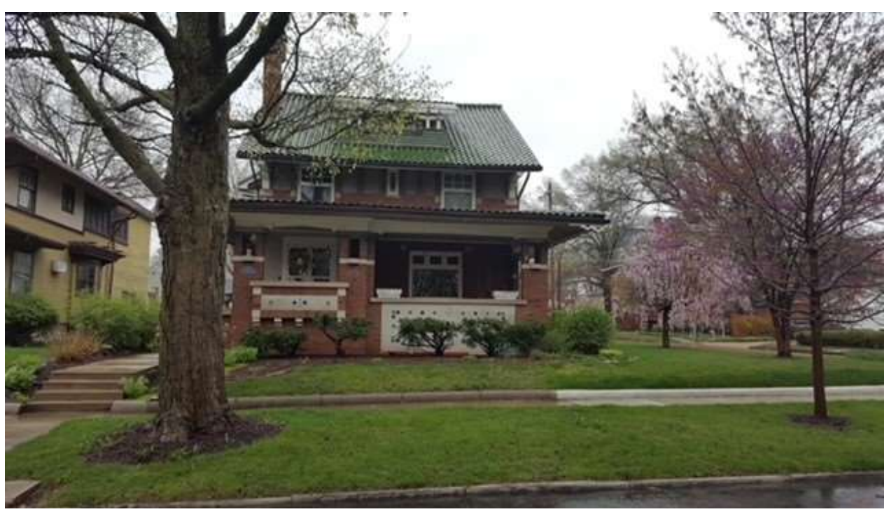
Above: The subject property at 1301 N Clinton Blvd

in the amount of $1,460.00 for replacement of garage fascia and rake boards for the property located at 1301 N Clinton Blvd. PIN:14-33-479-019. White Place Historic District.