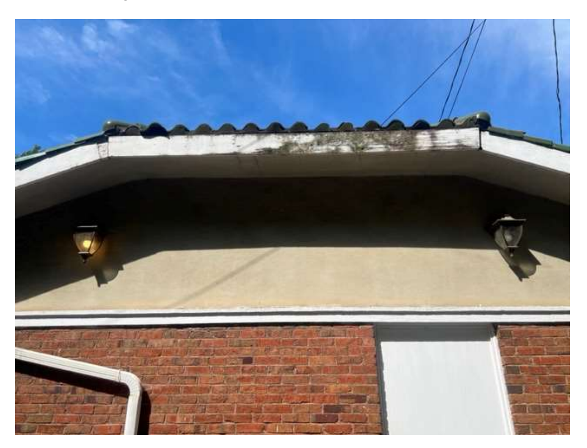
Attachment 2 - Site Photos