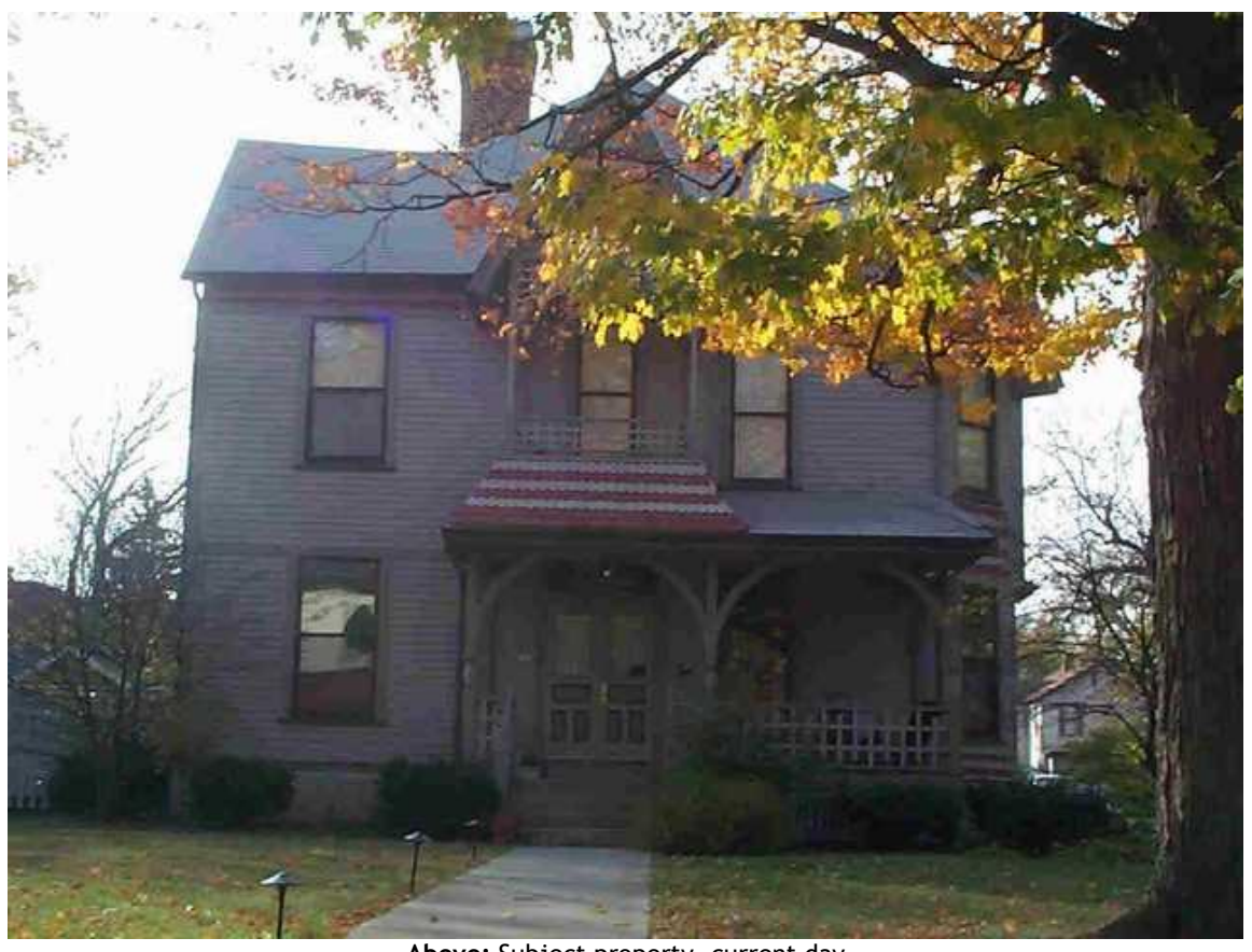
Above: Subject property, current day

at 1101 E. Jefferson Street. PIN: 21-03-328-001.