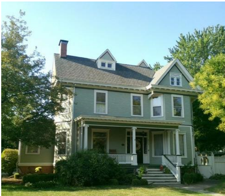
Above: The subject property at 905 E Jefferson Street.