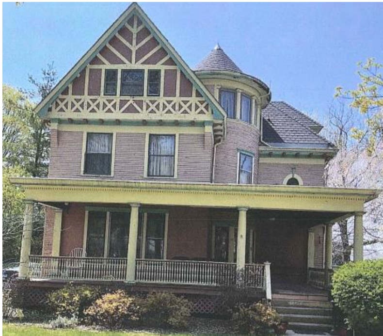
Above: The subject property at 1001 E Jefferson Street.