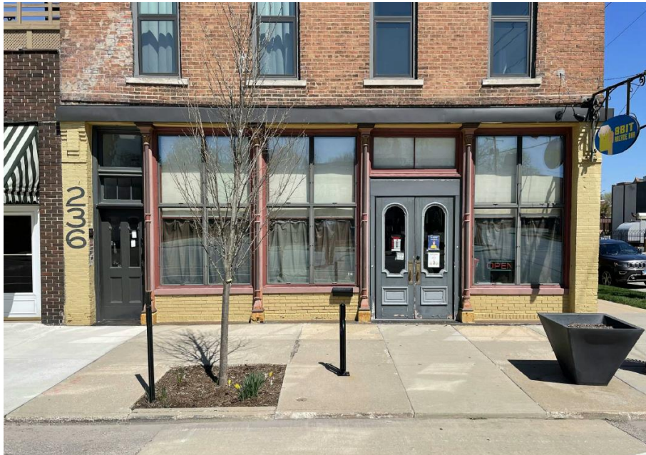
Above: The subject property at 236 E. Front Street