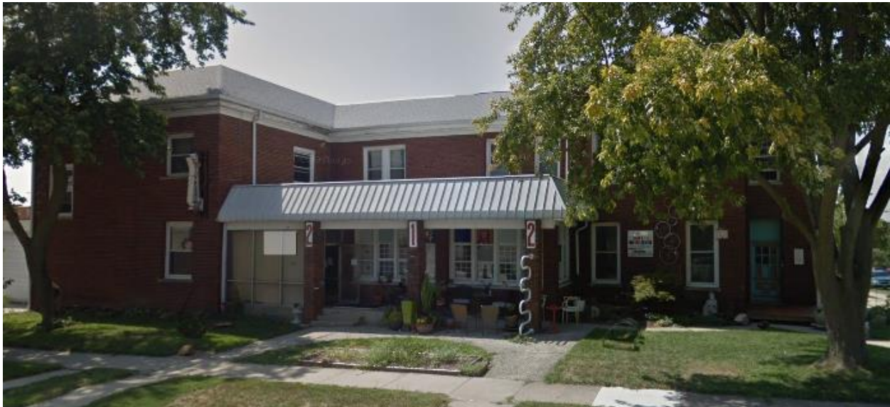
Above: The subject property at 212 N Roosevelt Avenue