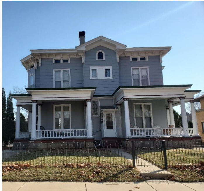
Above: The subject property at 319 E Chestnut Street.