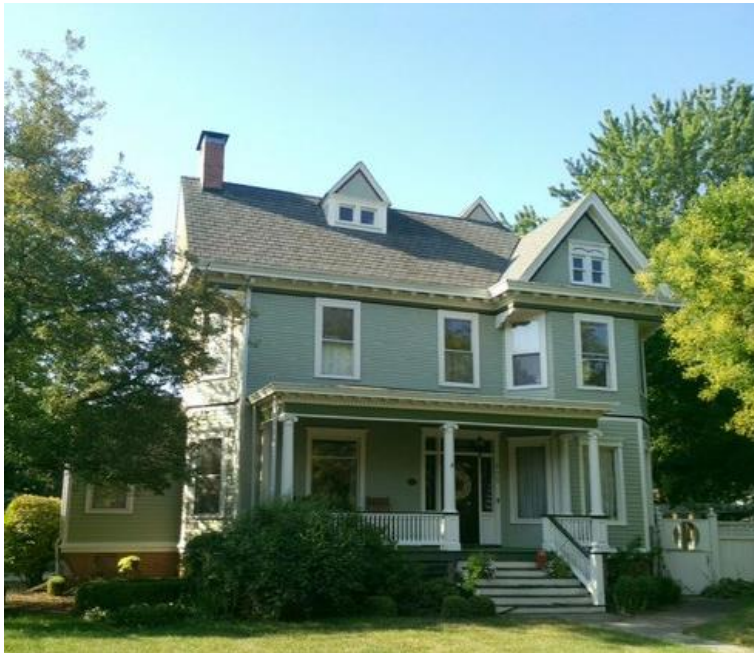
Above: The subject property at 905 E Jefferson Street.