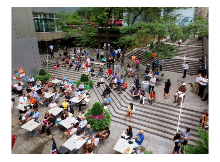
EX. 2: PUBLIC PLAZA