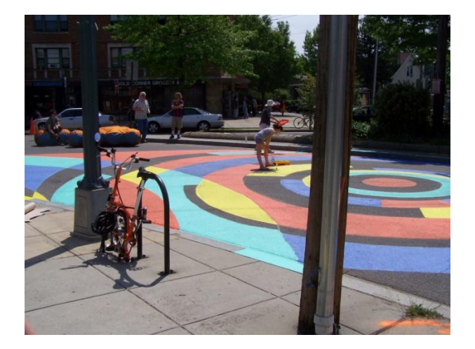
EX. 4: STREET ART