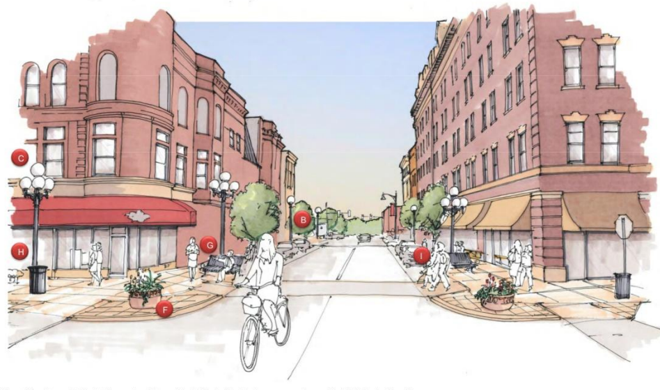
igure 3.2c - Conceptual view looking west on Jefferson Street at Center Street. Letters correspond to amenities highlighted on Page 13.

Downtown Streetscape Lighting Master Plan