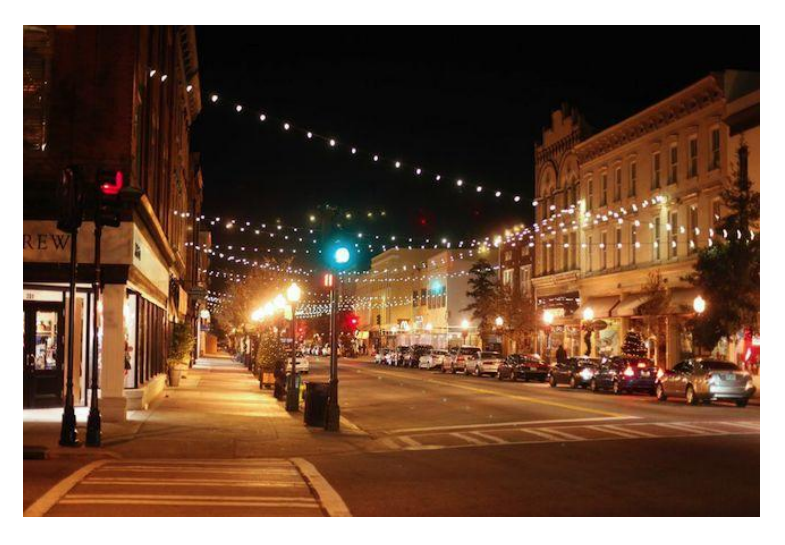
EX. 5: DECORATIVE LIGHTING