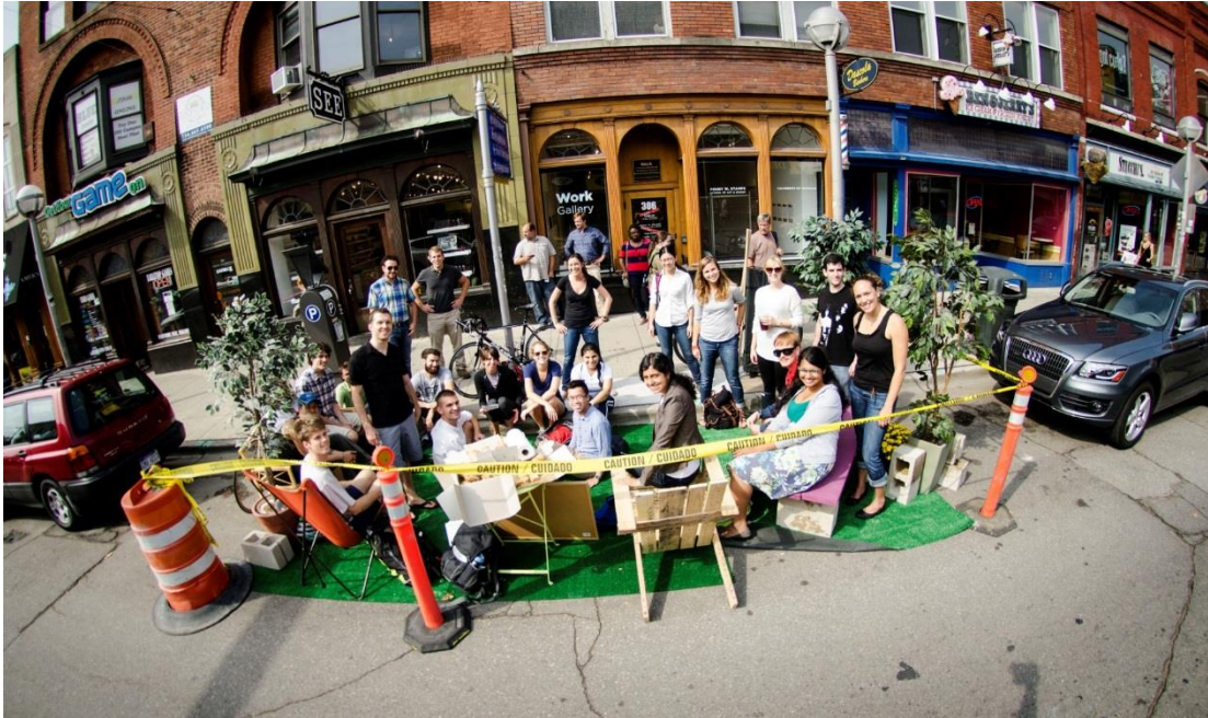
Ann Arbor, MI

Downtown Bloomington PARK (ing) day – September 15 and 16