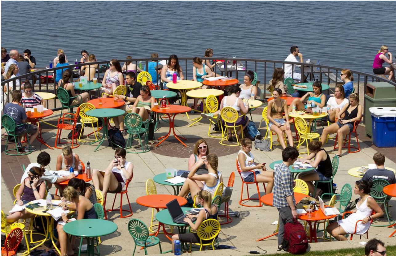
Memorial Union Terrace (Madison, WI)