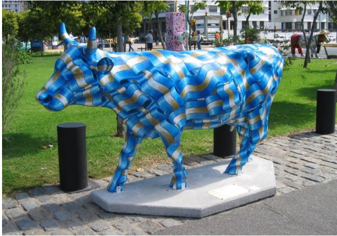
The Cow Parade