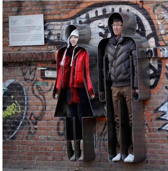
“You & Me” (Beijing, China)