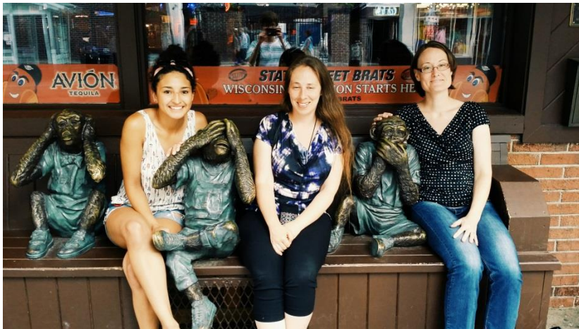
3 Monkeys (Madison, WI)