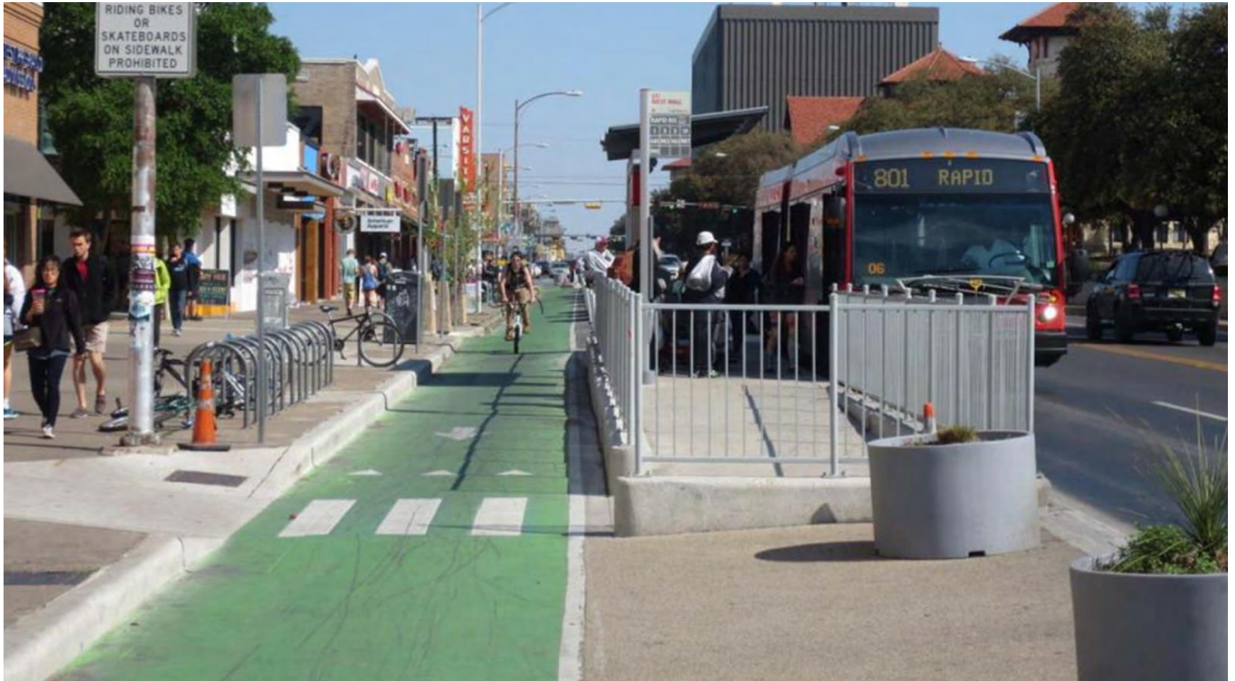
Guadalupe Street (Austin, TX)