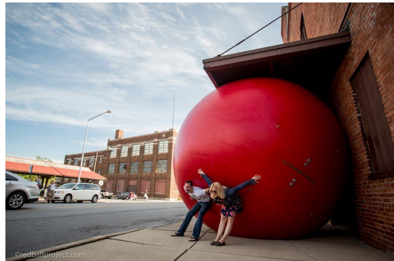
The Red Ball Project