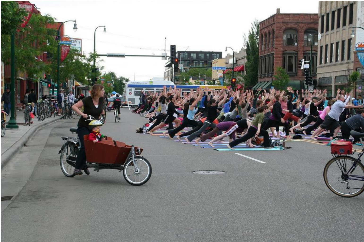
Yoga in the street (Minneapolis, MN)