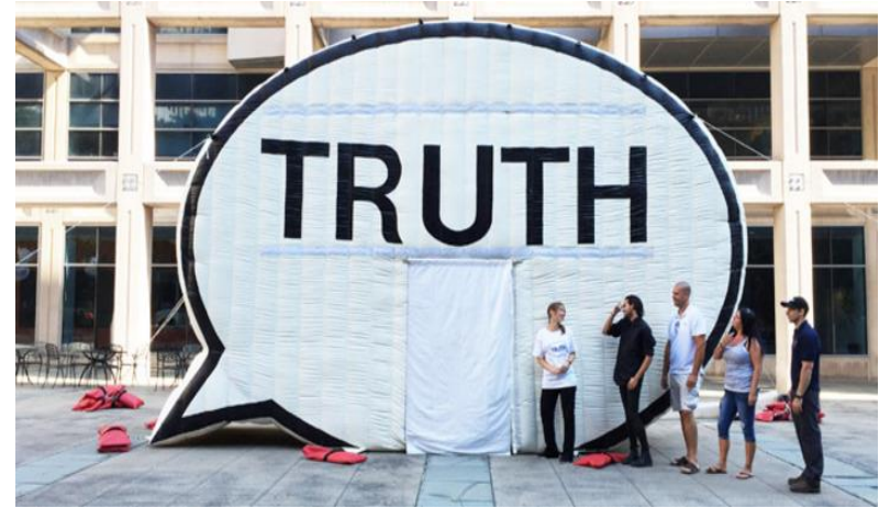
The Truth Booth