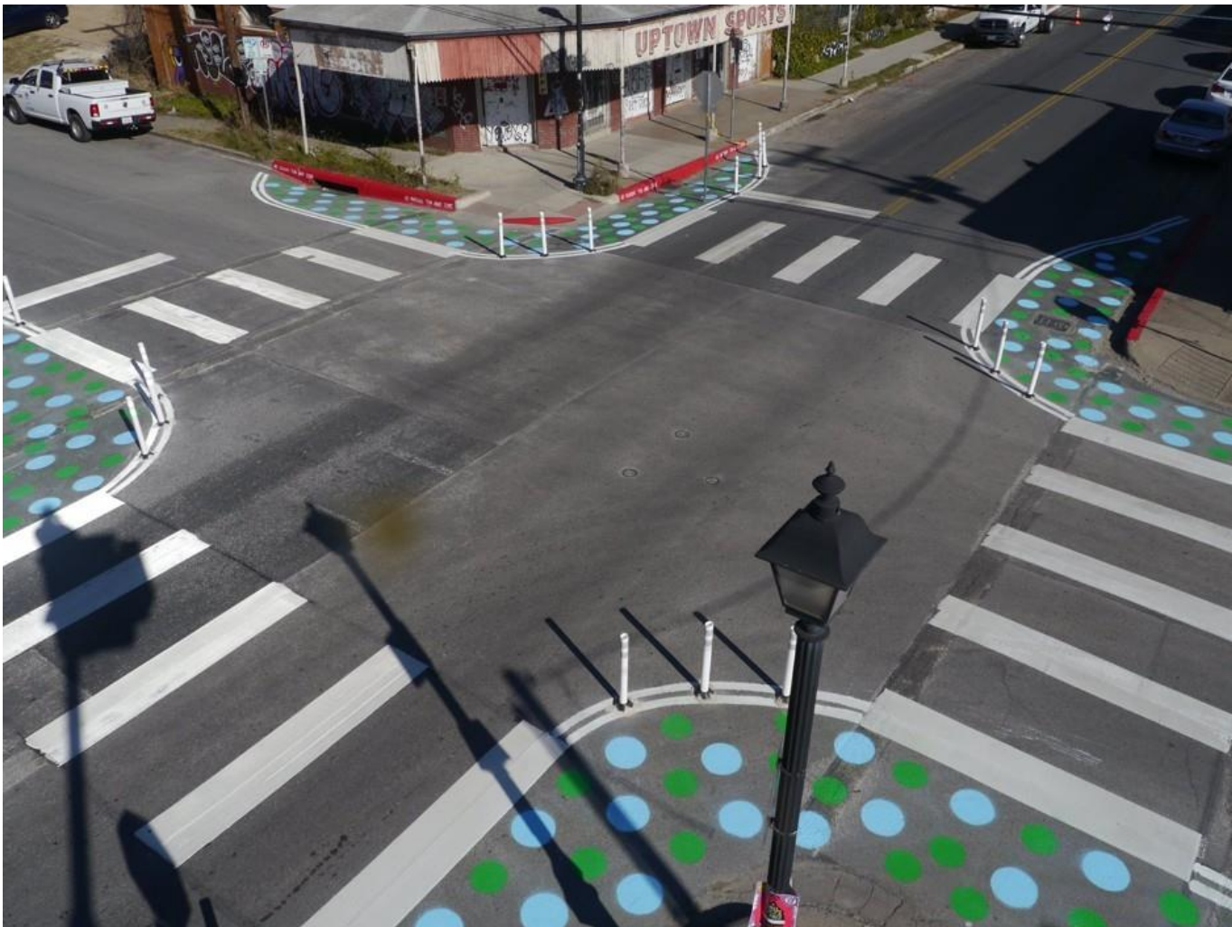
Intersection in Austin, TX