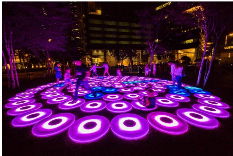
“Super Pool” light installation