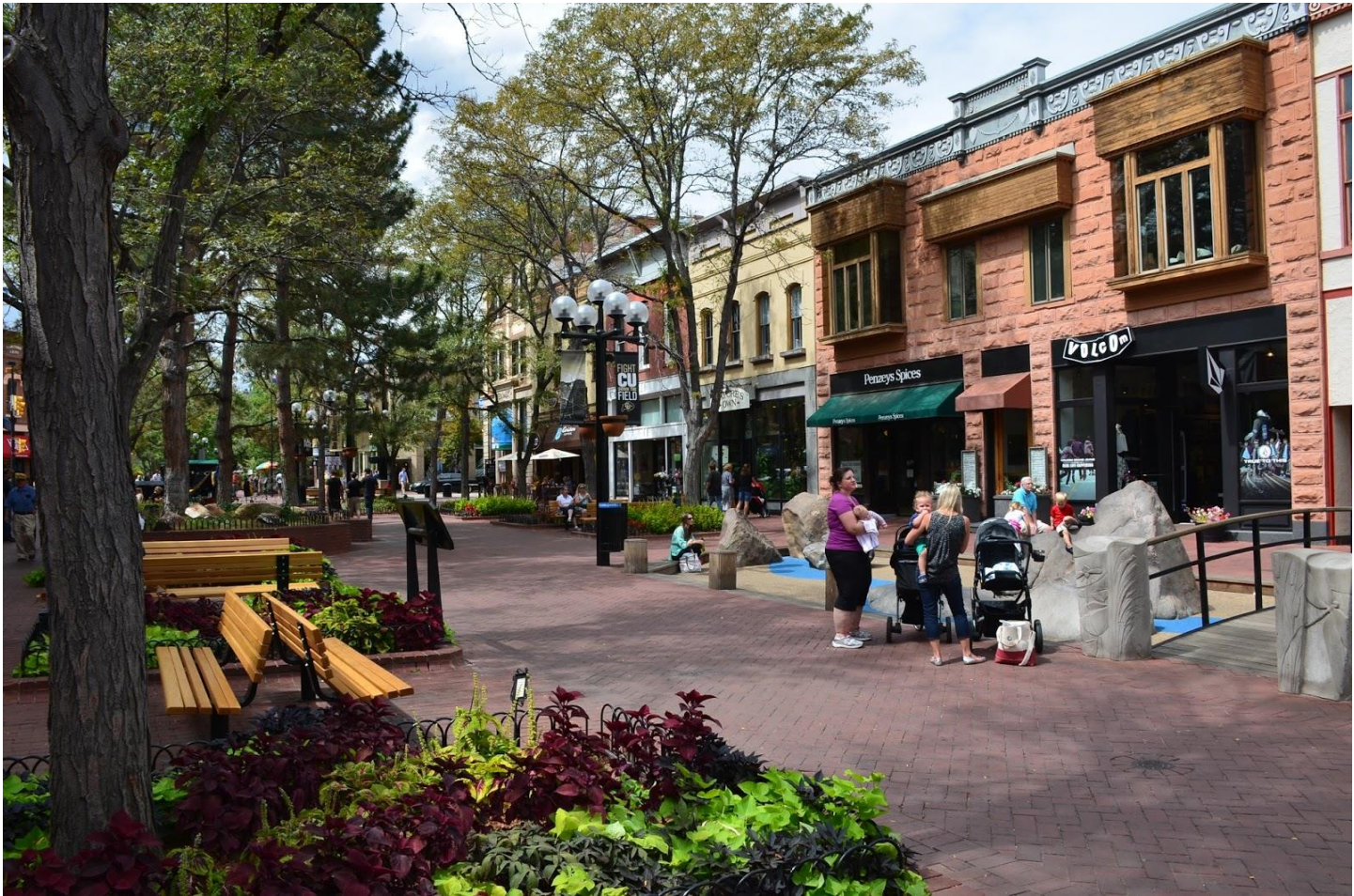
Pearl Street (Boulder, CO)