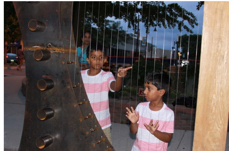
Outdoor instruments in Ames, IA