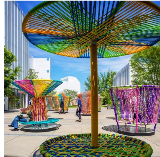
“Los Trompos” (Spinning Tops) Atlanta, GA