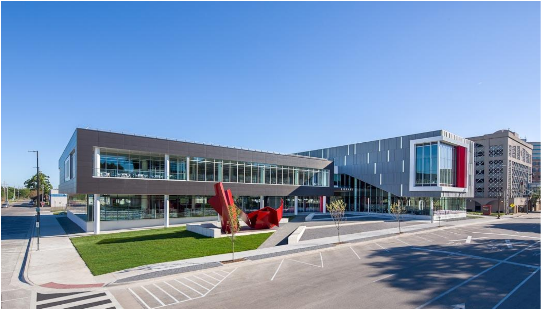
Cedar Rapids Public Library (Cedar Rapids, IA)