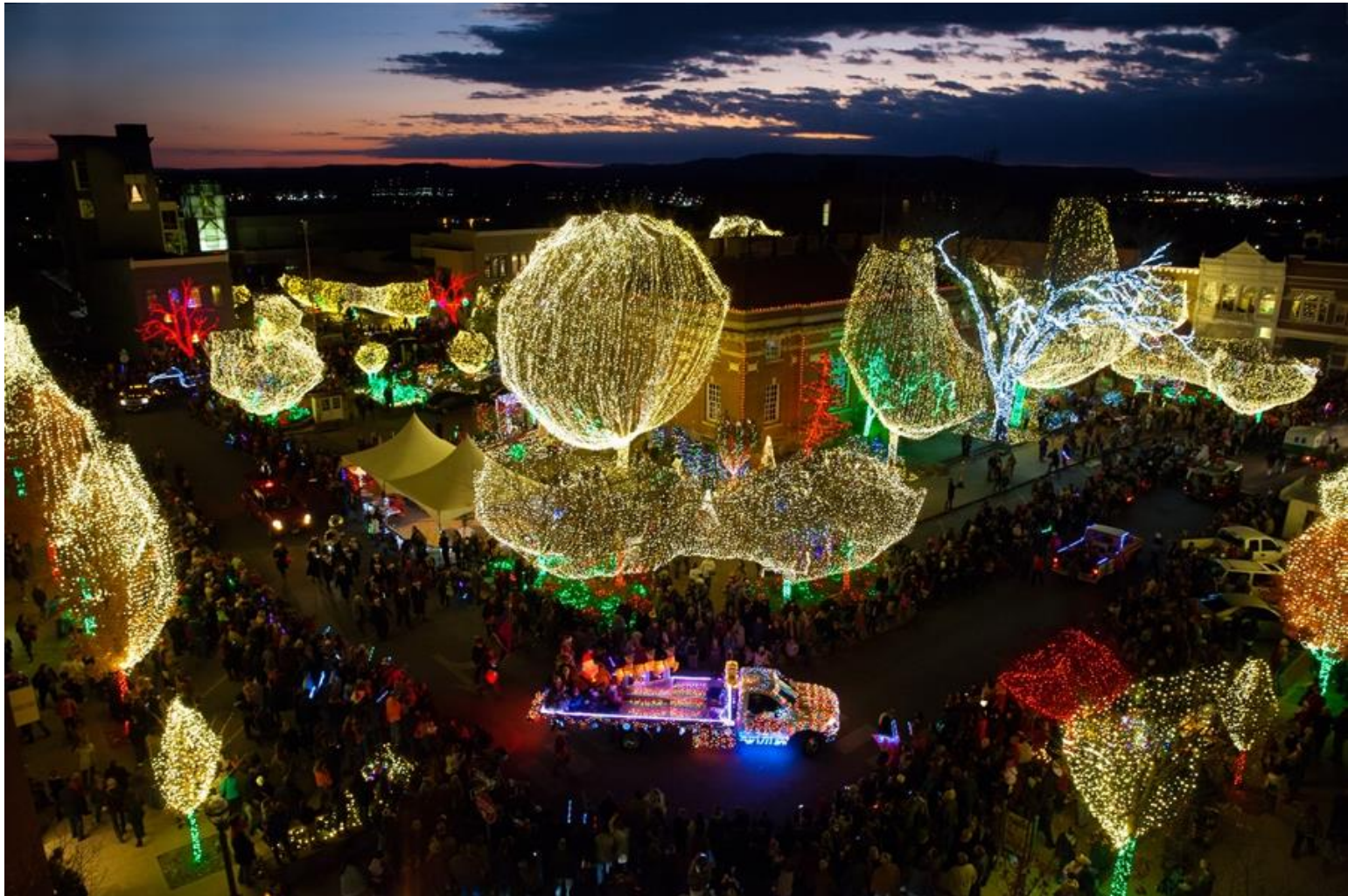
Lights of the Ozarks (Fayetteville, AK)