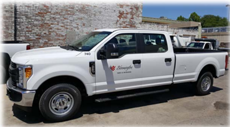
2 FORD 250