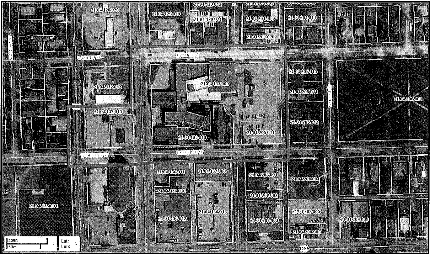
Exhibit A: North Main Street / Chestnut Street Study Area